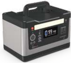
EN-TRA500 LiFePO4 , 537 WH